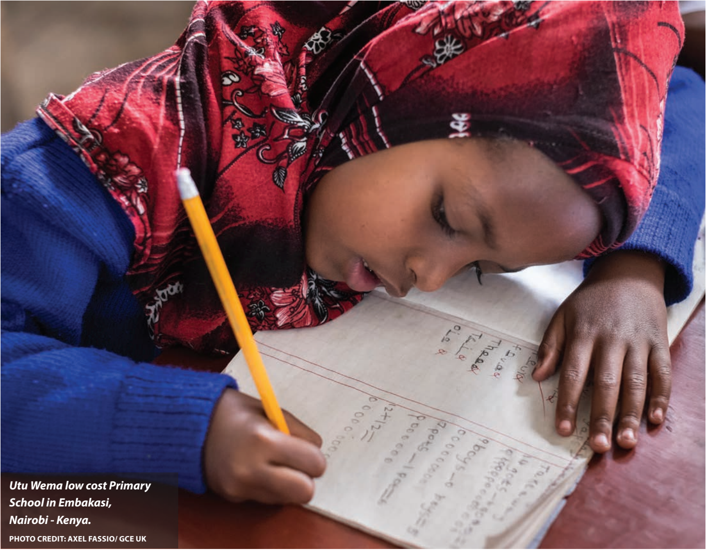
Utu Wema low cost Primary School in Embakasi, Nairobi - Kenya.